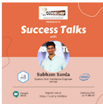
Success Talks 2.png 274K